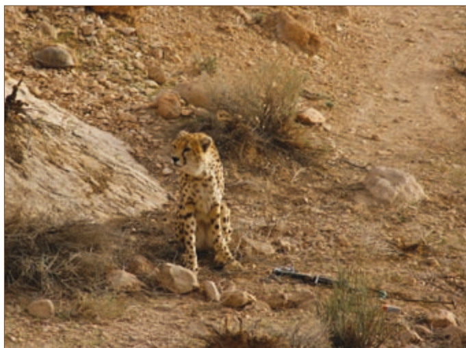
Fig. 3. Cheetahs were relatively calm in foot-snares and did not struggle violently when captured. All cats captured by foot-snares were unhurt by the process.