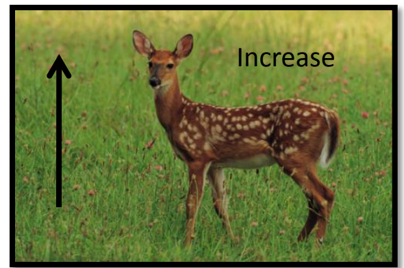
Changes in one causes changes in all. There is always a chain reaction in a food pyramid.